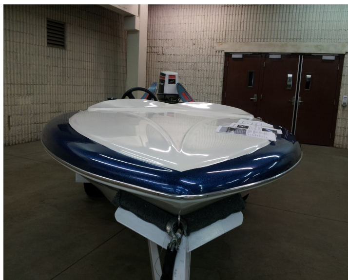
1959 Biesemeyer gleams at the 2013 Progressive RV, Sports, Boat, and Travel Show.

Thad Bergh's Aluminum Orlando Clipper with 75 hp Mercury 6 cylinder "Tower of Power" outboard was a true find and was new this year's show. Light weight, big outboard power, and a sleek hull design will surely make this a speed demon on smooth early lake waters this summer! Although often overlooked in the world of classic boating, these aluminum classics with hundreds of tightly spaced rivets and unique cast components are more interesting than ever!