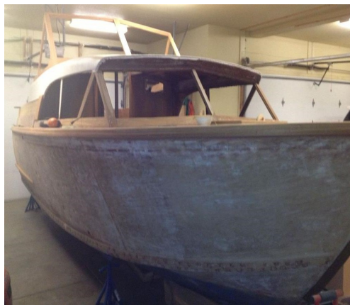
A work in progress...

sembly, and we developed what I hope to be a good way to catalog and mark all the pieces and parts as we