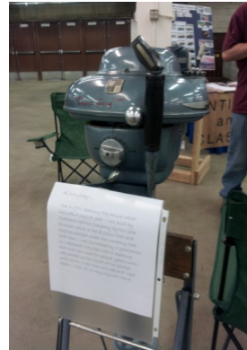
1951 Seaking 5hp Deluxe

Skagit in Puget Sound for several years until I was brought out to Colorado where I was used for several years until I was overhauled. I am a rare motor as I have an electric start. I still use a pressure tank. I hope to be running soon as my owners are slowly restoring me.