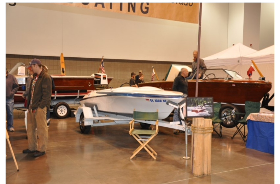
L to R—Ball Four, Biesemeyer, Kokopeli, January, 2013.