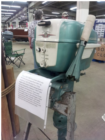
1957 OMC Buccaneer

Classic things from bygone eras speak to us, and that was never more true than at the RMC display at the 2013 March RV, Sport, Boat and Travel Show.