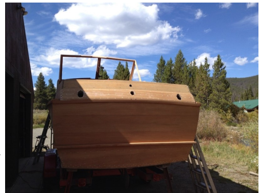
A big step—new transom installed!

When I contacted the Chris-Craft Cavalier section on the Chris-Craft Antique Boat Club's Boat Buzz Forum, I received mixed messages of encouragement to move forward with the restoration. Right or wrong, while I had no link to her, and didn't know her story, I saw this as a project for my son and I to tackle. He very much enjoys working with me on our '49 Century Sea Maid, and often asked for opportunities to go up to Frisco, Colorado, and