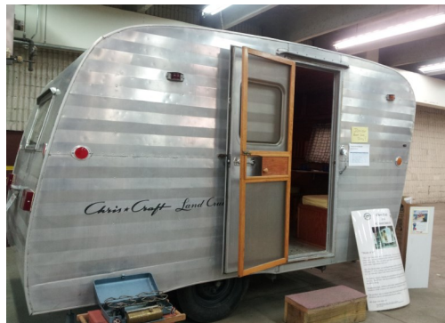
1954 Chris Craft Travel Trailer