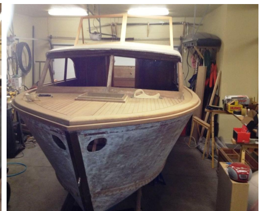
Mahogany plank deck is a BIG Improvement.