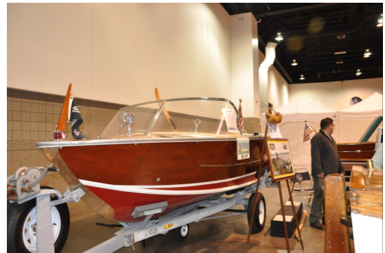
1962 Century Dart, "Ball Four"; Owner: Rich Ball