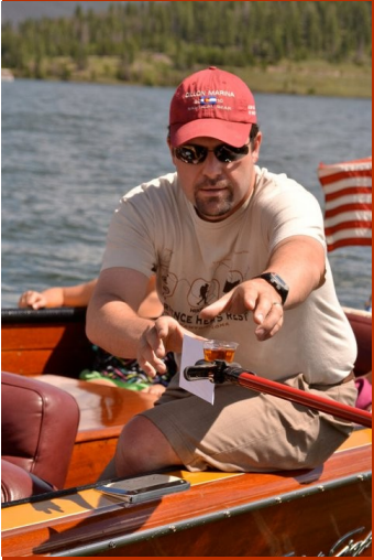
An iconic image—poker run transfer—a card and a drink.

Visit www.rockymtnclassics.org to see all the pictures from this fun event!