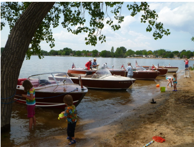
Boats beached at North Shore Park for the picnic. Visit www.rockymtnclassics.org for more pics!

First there is the lake itself. Lake Loveland is a man-made reservoir that provides water to the city of Greeley. When originally completed in the fall of 1894, it was described as the “most complete reservoir system in Colorado.” Fed by the ditch waters diverted from the Big Thompson River, a full Lake Loveland fills a basin of 475 acres with a deep-water mark of 39.5 feet. The lake is rimmed by more than 100 homes, the owners of which also own the recreation rights on the lake