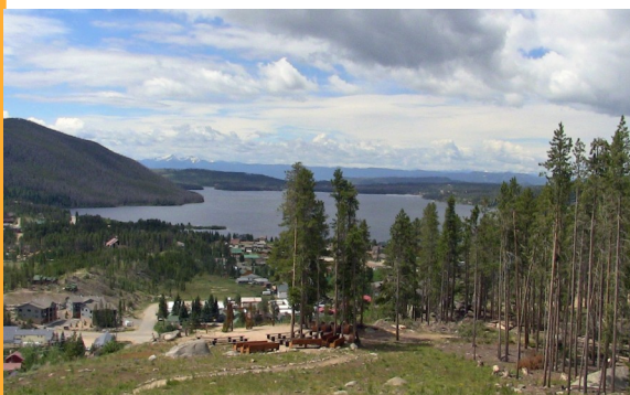
View of Grand Lake, July 2011.

the current in the channel between the lakes was running fast, making it a little more difficult to get into Shadow Mountain Lake, so we had the picnic at the park near the marina.